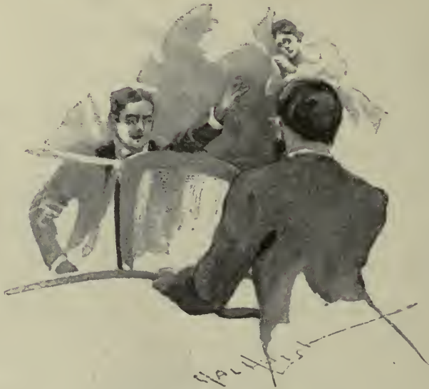
INTERPOSED A CHAIR

'Respectful be hanged!' he shouted. Vernon was certainly very much excited.